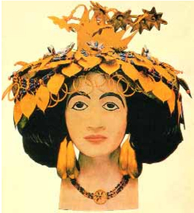
Reconstruction of the golden headdress of the Sumerian Queen Shub-A, who died in about 2700 BC.

brought to light countless such cylinder seals. Since most of them were made out of precious stones, it is justifiable to assume that crystals and gemstones were in everyday use in Mesopotamia – at least for members of the upper classes. The Assyriologist Samuel Noah Kramer has described some of these seals as follows: “One of the favourite subjects for gem cutters in southern Mesopotamia was a scene in which a man is introduced to one god by another god; probably the owner of the seal was being introduced to his personal patron divinity. Further north, in Assyria, the gem cutters developed an entire repertoire of objects and styles with heraldic motifs, animal fight scenes and stories about the gods.”