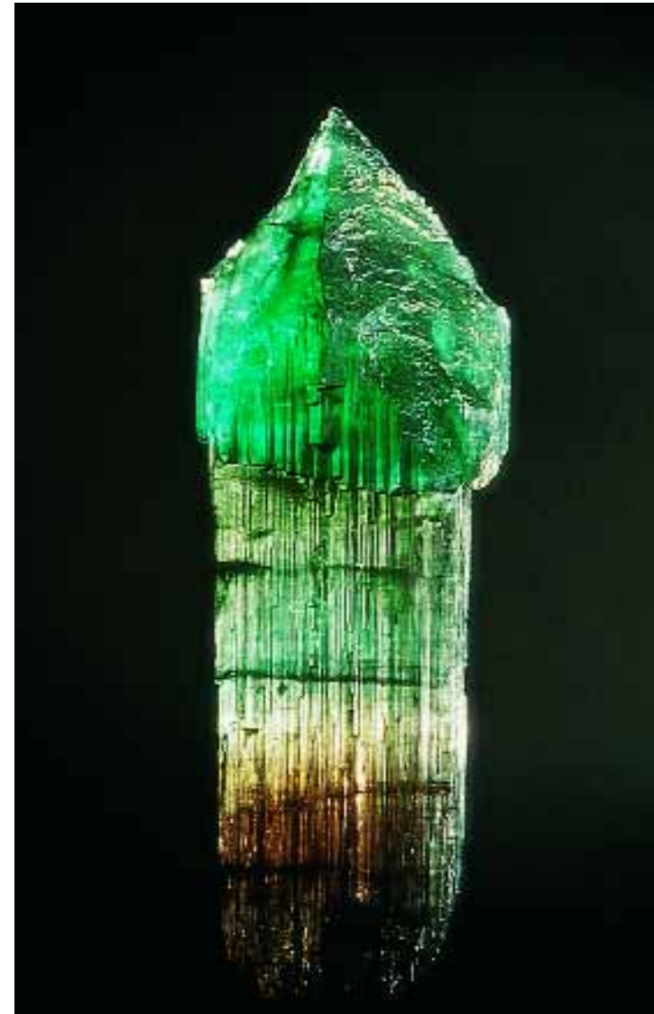
Tourmaline (multi-coloured sceptre crystal), Brazil