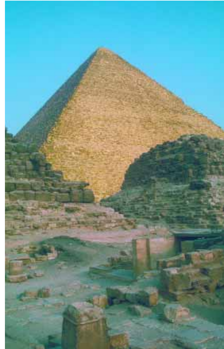
The pyramids – five-thousand-year-old symbols of the highly advanced civilisation of Ancient Egypt.

If a stone is seen as the “House of God”, then it is not so large a step to a stone altar on which sacrificial offerings are made to the god(s). Stone as the “House of God” functioned as “the protective”, “the giver of fertility”,